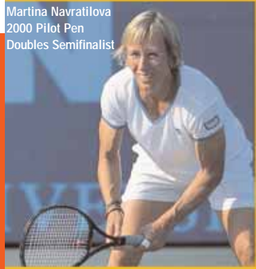
Martina Navratilova 2000 Pilot Pen Doubles Semifinalist

New Haven has an active gay community with many organizations and businesses catering to every taste. Visitors will likely find gay-owned and gay-friendly shops and cafes, galleries and nightlife sprinkled throughout the city.